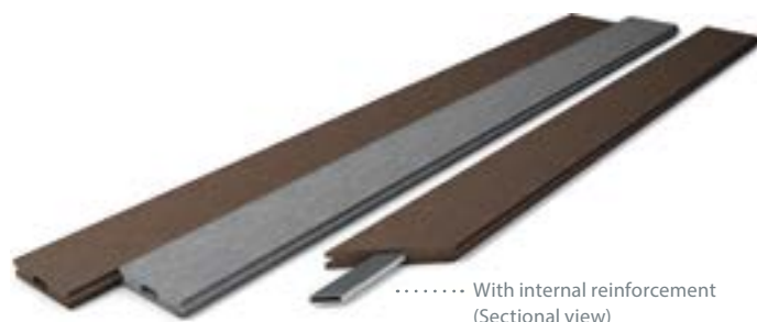
..... With internal reinforcement (Sectional view)

While mounting, please pay attention to temperature-dependent length deviations (up to +/- 1.5%) and enquire about the maximum span width.