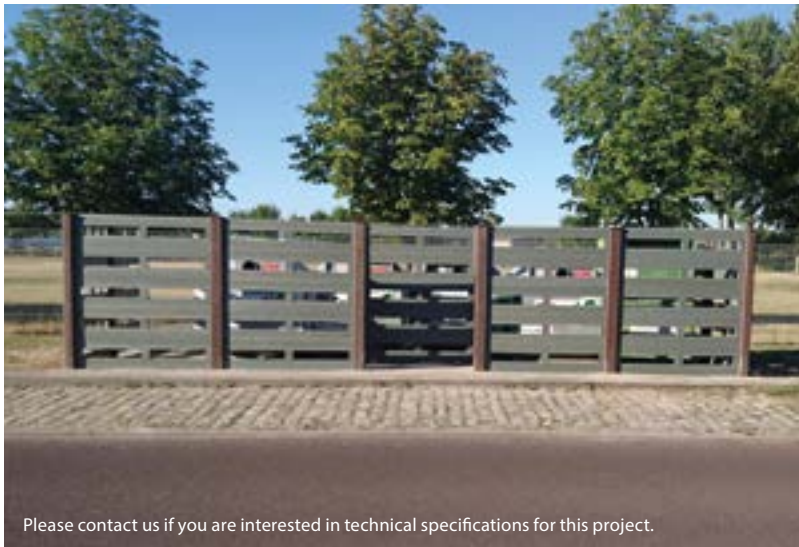
Please contact us if you are interested in technical specifications for this project.